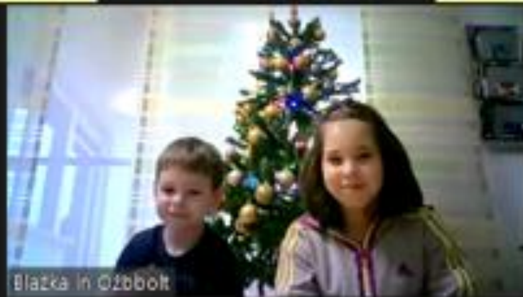
Blazka in Ožbbolt